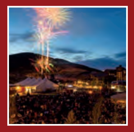
3<sup>rd</sup> of July Celebration

We are constantly promoting Canyons Village as an exciting alpine escape with year-round activities. The Transient Occupancy Assessment has helped us achieve significant economic impact throughout the Village: