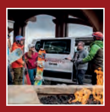
Canyons Village Connect